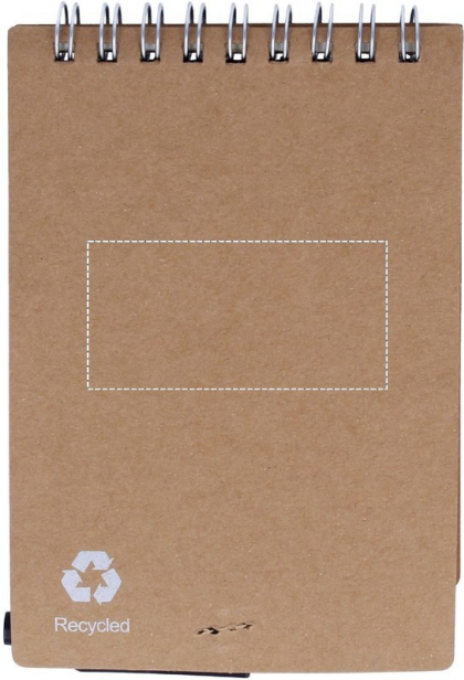
2. BACK NOTEBOOK