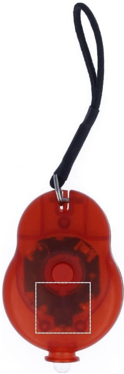
4. FRONT RED LIGHT