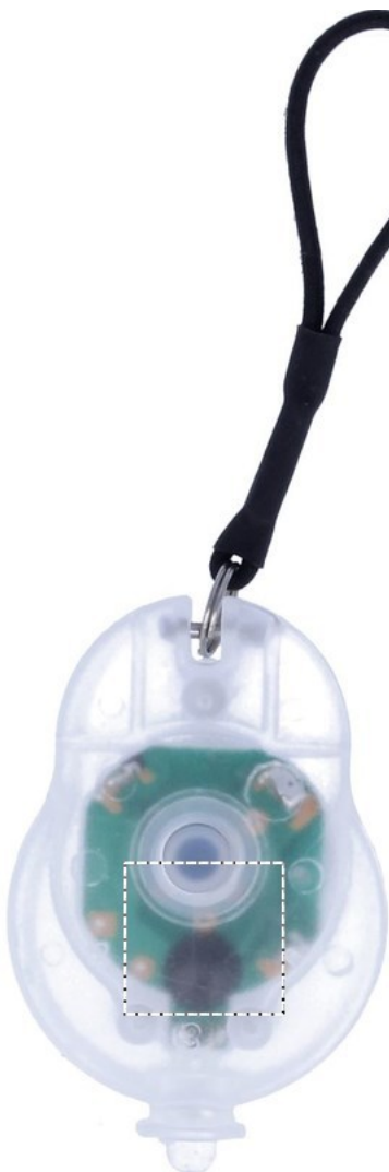
2. FRONT LIGHT