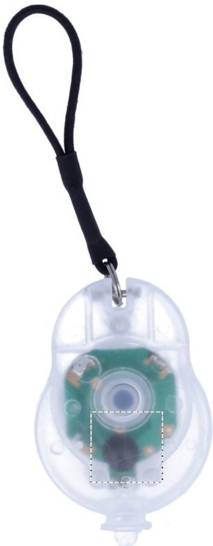
3. BACK LIGHT