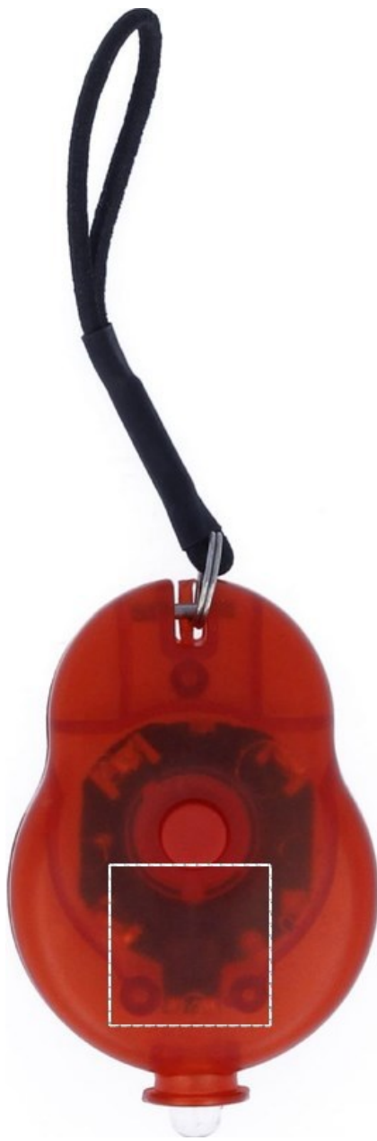
5. BACK RED LIGHT